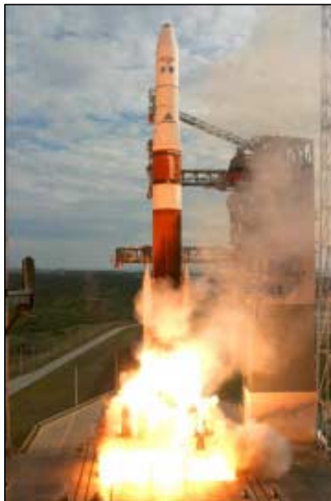
New GOES-N satellite launches, carrying an imaging radiometer, an atmospheric sounder, and a collection of other space environment monitoring instruments.

Unlike all previous GOES satellites, GOES-N carries star trackers aboard to precisely determine its orientation in space. Also for the first time, the storm-tracking instruments have been mounted to an "optical bench," which is a very stable platform that resists thermal warping. These two improvements will let scientists say with 2 to 4 times greater accuracy exactly where storms are located.