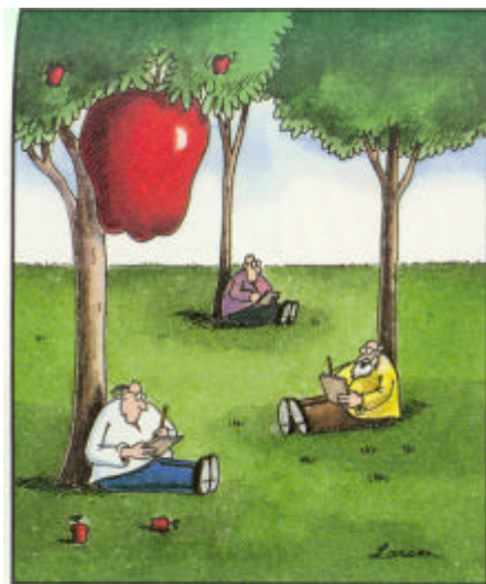
"Nothing yet. ... How about you, Newton!"