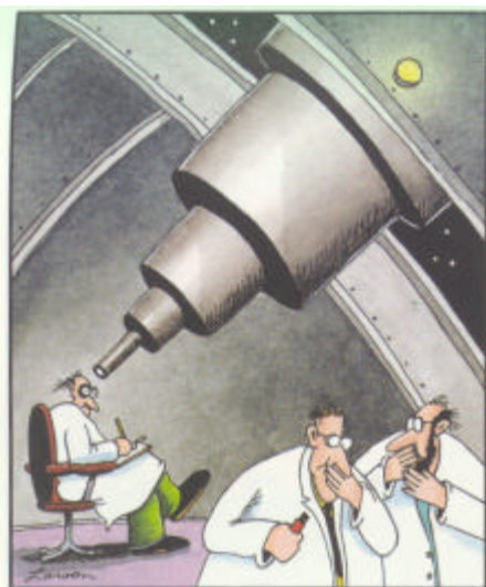
Two of my favorite cartoons from "The Far Side" by Gary Larson. Reprinted from the "Countdown to the Millenium Calendar."

7:30 p.m. at Grand Canyon University, Fleming Building, Room 105: 1 mile west of I-17 on Camelback Rd., North on 33rd Ave., Second building on the right.